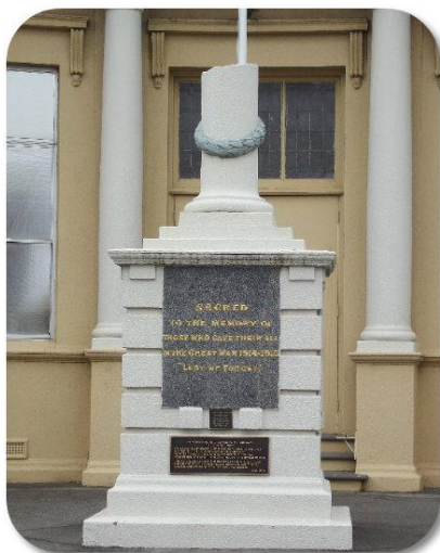
Northcote War Memorial

The Northcote War Memorial does not list individual names.